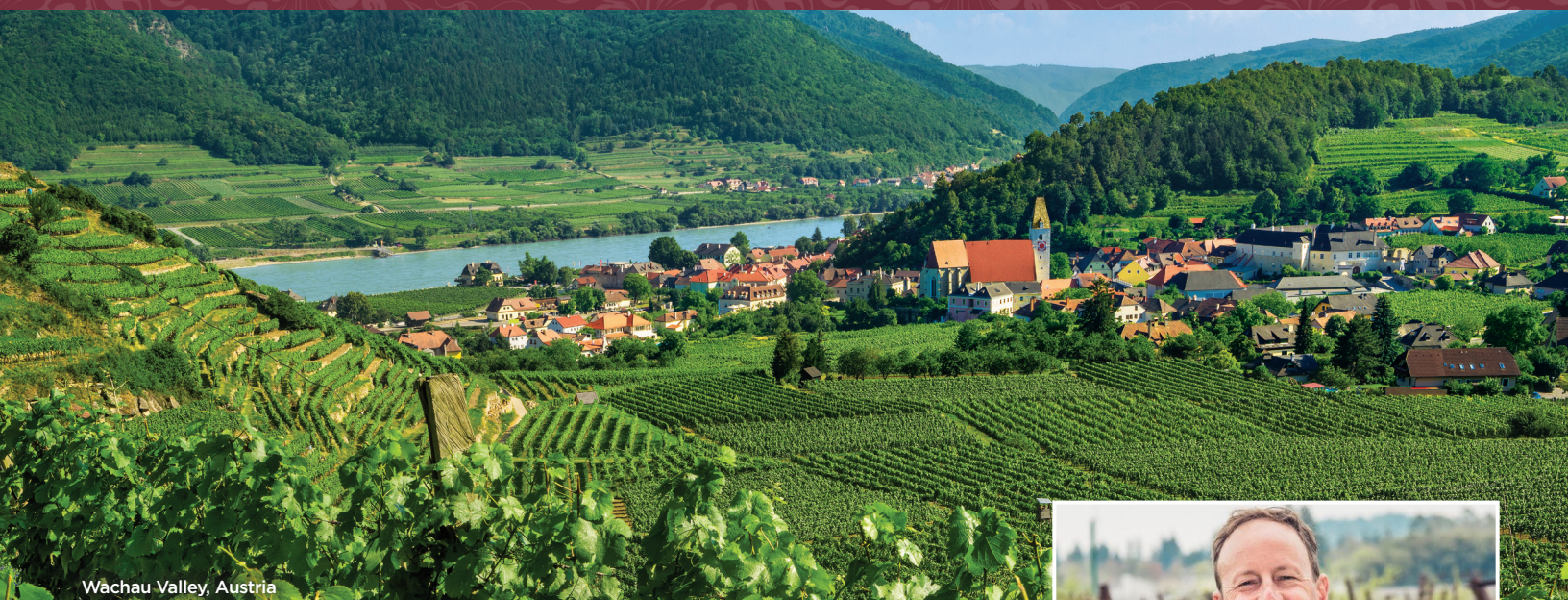
Wachau Valley, Austria

Uncork local traditions, savor intense flavors and enjoy palate-pleasing adventures during an AmaWaterways Wine Cruise